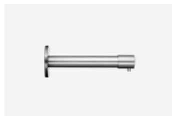
Wall Mounted Manual Soap Dispenser TSL.470