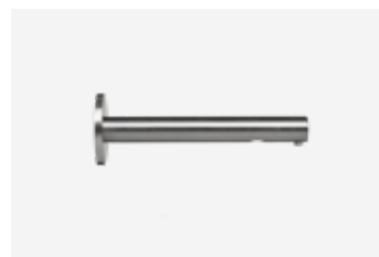
Wall Mounted Sensor Soap Dispenser TSL.467