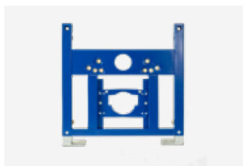
WC Frame TSL.WCFRAME