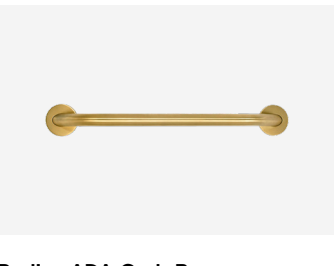
Radius ADA Grab Bars TSL.GR.45.36.BR