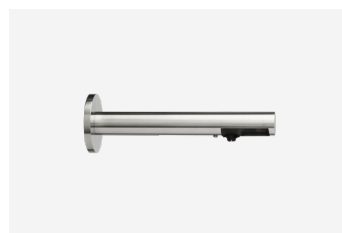
The Channel Soap Dispenser TSL.C.040