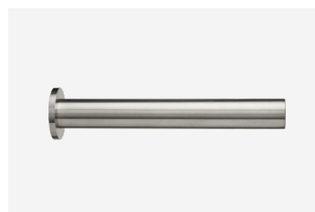
The Channel Hand Dryer TSL.C.060