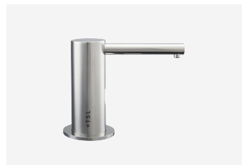
Radius Deck Mounted Soap Dispenser TSL.420