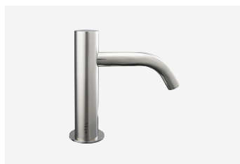
Radius Deck-Mounted Sensor Faucet/Small TSL.990