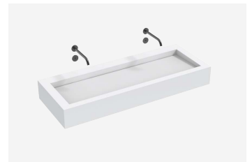
Monolith A Series TSL.MON.A