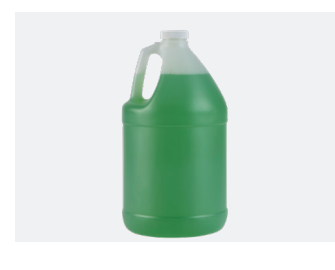
Antibacterial Foam Soap LFS-AB