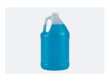
Luxury Blue Foam Soap LFS-LB