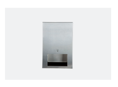
Recessed Combination Unit / Dryer TSL.LM9