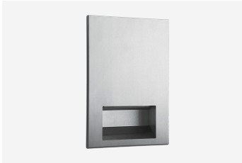
Hand Dryer TSL.LM9

If a situation arises where you require replacement components outside of a maintenance contract, there may be provision to obtain spare parts. Providing the components are under warranty and the parts have become non-functioning during normal use within their assumed usable life, they may be replaced. Should a replacement mains power supply be required it is imperative that an identical type is used. Contact The Splash Lab for further information.