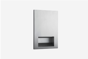
Combination Unit TSL.LM8