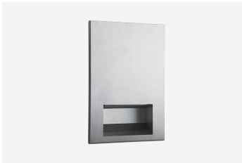
Combination Unit TSL.LM9

If a situation arises where you require replacement components outside of a maintenance contract, there may be provision to obtain spare parts. Providing the components are under warranty and the parts have become non-functioning during normal use within their assumed usable life, they may be replaced. Should a replacement mains power supply be required it is imperative that an identical type is used. Contact The Splash Lab for further information.