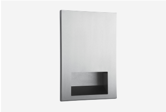
Paper Towel Dispenser TSL.LM8