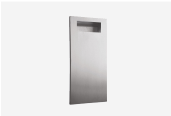
Combination Unit TSL.LM11