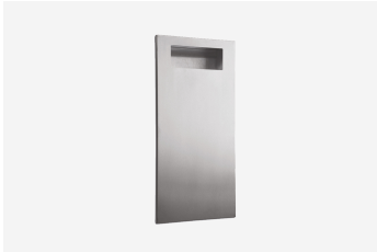
Combination Unit TSL.LM11

If a situation arises where you require replacement components outside of a maintenance contract, there may be provision to obtain spare parts. Providing the components are under warranty and the parts have become non-functioning during normal use within their assumed usable life, they may be replaced. Should a replacement mains power supply be required it is imperative that an identical type is used. Contact The Splash Lab for further information.