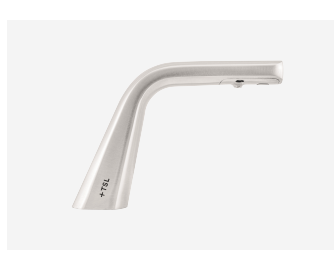
The Ribbon Soap Dispenser TSL.R.010