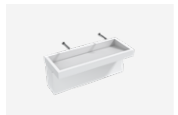
The Monolith C Series TSL.MON.C