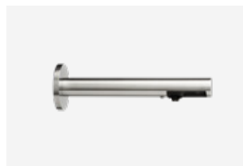
The Channel Soap Dispenser TSL.C.040