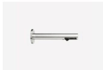
The Channel Soap Dispenser TSL.C.040