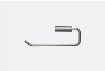
Double Toilet Roll Holder TSL46