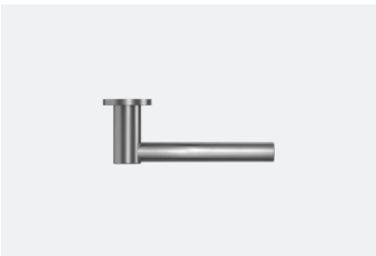
Straight Door Handle TSL.H25

Must be mounted to an appropriate hard surface The Splash Lab is not responsible for improper installation or misuse.