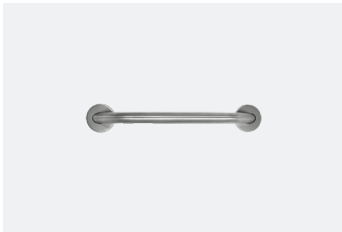
Straight Grab Bar 450mm TSL.GR45.450

For warranty terms and conditions please visit www.thesplashlab.com If additional spare parts are required and are not listed below, please contact us at info.uk@thesplashlab.com