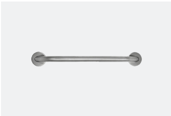
Straight Grab Bar 600mm TSL.GR45.600