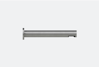
Channel Hand Dryer TSL.CO61