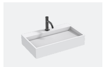
Nano Basin TSL.N