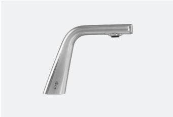
The Ribbon Sensor Tap 2.0 TSL.R021