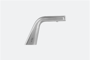
The Ribbon Soap Dispenser TSL.R011