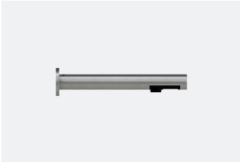
Channel Sensor Tap / 230mm TSL.CO51