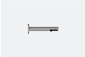
Channel Soap Dispenser TSL.CO41

For warranty terms and conditions please visit www.thesplashlab.com If additional spare parts are required and are not listed below, please contact us at info.uk@thesplashlab.com