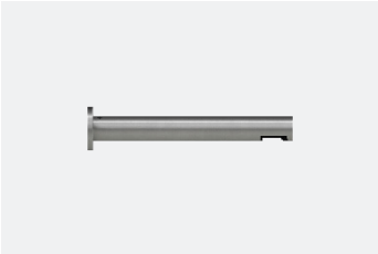
Channel Hand Dryer TSL.CO61