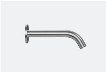
Radius Auspex Tap 150mm TSL.895