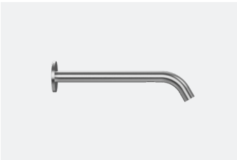
Radius Auspex Tap 220mm TSL.894