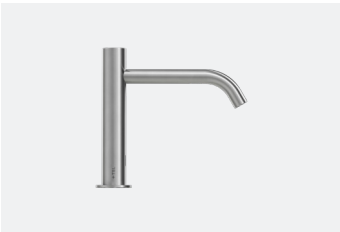
Sensor Deck Mounted Tap Large TSL.960