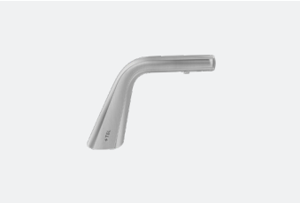
The Ribbon Soap Dispenser TSL.R011