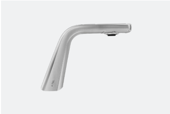
The Ribbon Sensor Tap 2.0 TSL.R021