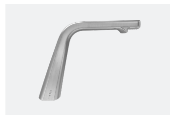
The Ribbon Hand Dryer TSL.R031