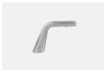
The Ribbon Soap Dispenser TSL.R011