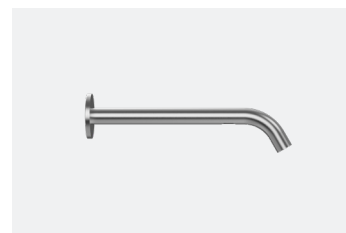
Radius Auspex Tap 220mm TSL.894