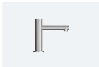
Straight Spout Tap Small TSL.980