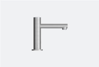
Straight Spout Tap Small TSL.980

For warranty terms and conditions please visit www.thesplashlab.com If additional spare parts are required and are not listed below, please contact us at info.uk@thesplashlab.com