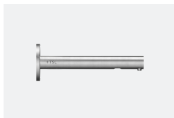
Wall Mounted Sensor Soap Dispenser TSL.467