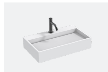
Nano Basin TSL.N