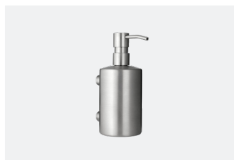
Wall-Mounted Cylindrical Pump Soap Dispenser TSL.938