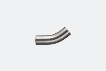
Coat Hook TSL.974