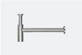
Adjustable Bottle Trap TSL.650