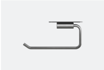
Double Toilet Roll Holder With Shelf TSL.49

For warranty terms and conditions please visit www.thesplashlab.com If additional spare parts are required and are not listed below, please contact us at info.uk@thesplashlab.com