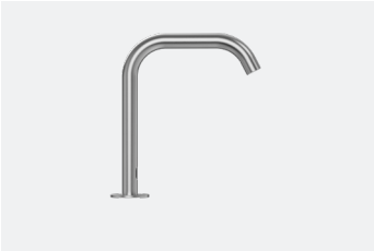
Radius Auspex Square Neck Tap TSL.893

For warranty terms and conditions please visit www.thesplashlab.com If additional spare parts are required and are not listed below, please contact us at info.uk@thesplashlab.com