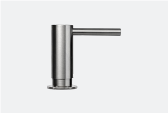
Manual Deck Mounted Soap Dispenser TSL.410