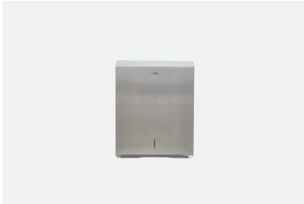
Wall-Mounted Paper Towel Dispenser TSL.735

For warranty terms and conditions please visit www.thesplashlab.com If additional spare parts are required and are not listed below, please contact us at info.uk@thesplashlab.com