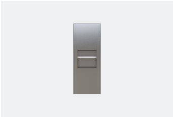
Combination Unit / 10L TSL.CM6