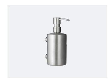
Wall Mounted Soap Dispenser TSL.938