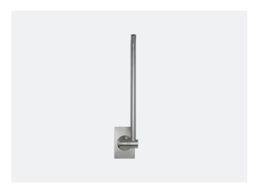
Hinged Grab Rail 450mm TSL.GR45