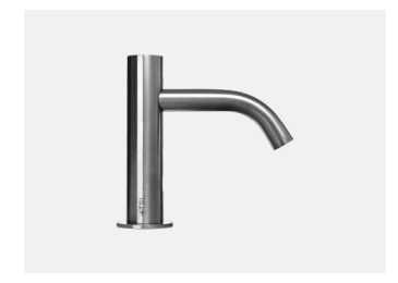
Deck Mounted Sensor Tap / Small TSL.990