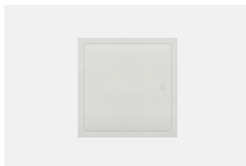
Metal Faced Access Panel TSLP.210001