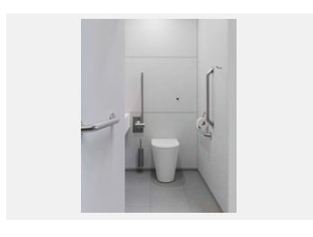
Ambulant Pack / Floor Standing WC / Hinged Grab Bar TSL.AMB.R4

UK: +44 (0) 161 482 7000 www.thesplashlab.com/uk info.uk@thesplashlab.com All things considered.