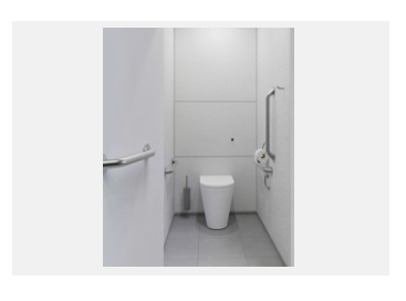
Ambulant Pack / Floor Standing WC / Straight Grab Bar TSL.AMB.R2