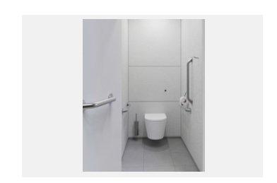
Ambulant Pack / Wall Hung WC / Straight Grab Bar TSL.AMB.R1