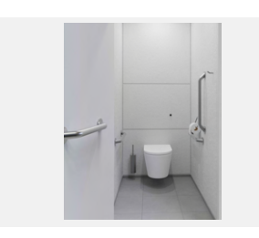
Ambulant Pack / Wall Hung WC / Straight Grab Bar TSL.AMB.R1