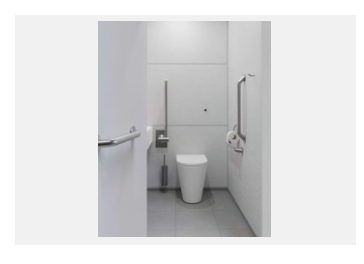
Ambulant Pack / Floor Standing WC / Hinged Grab Bar TSL.AMB.R4

UK: +44 (0) 161 482 7000 www.thesplashlab.com/uk info.uk@thesplashlab.com All things considered.