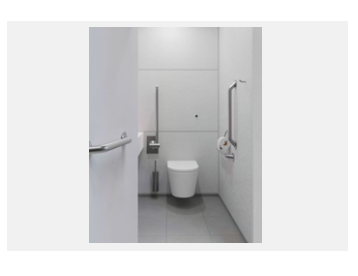
Ambulant Pack / Wall Hung WC / Hinged Grab Bar TSL.AMB.R3