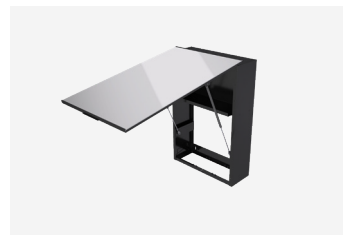
Behind The Mirror System / 600 TSL.MR30