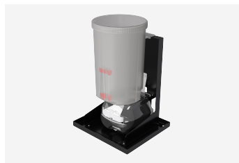
Behind The Mirror Soap Dispenser TSLP.BTM.001