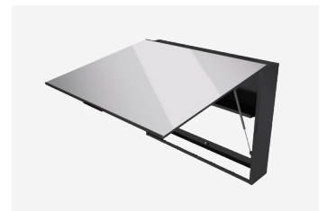
Behind The Mirror System / 1200 TSL.MR40