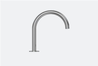
Radius Auspex Tap Swan Neck TSL.892