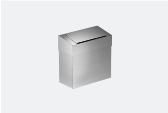
Wall-Mounted 7L Sanitary Bin TSL.909