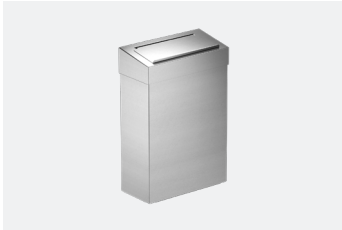
Wall-Mounted 10L Sanitary Bin TSL.908

For warranty terms and conditions please visit www.thesplashlab.com If additional spare parts are required and are not listed below, please contact us at info.uk@thesplashlab.com