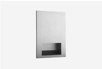
Combination Units - Paper Towel TSL.CM8

For warranty terms and conditions please visit www.thesplashlab.com If additional spare parts are required and are not listed above, please contact us at info.uk@thesplashlab.com