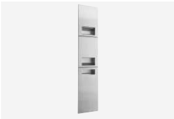
Combination Unit TSL.CM8910