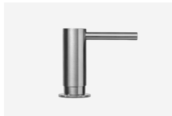
Deck Mounted Soap Dispenser TSL.410