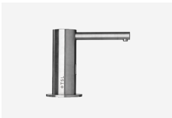
Sensor Deck Mounted Soap Dispenser TSL.420