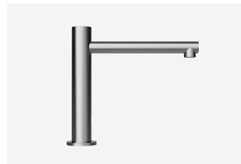
Straight Spout Tap / Large TSL.940