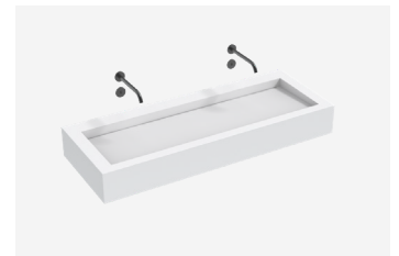
Monolith M Series - 450mm TSL.M