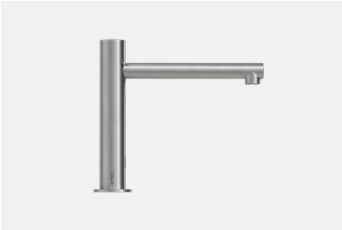
Straight Spout Tap Large TSL.940

For warranty terms and conditions please visit www.thesplashlab.com If additional spare parts are required and are not listed below, please contact us at info.uk@thesplashlab.com