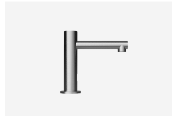
Straight Spout Tap / Small TSL.980