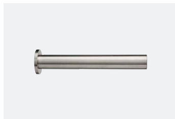
The Channel Hand Dryer TSL.C.061.CS