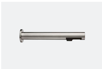
The Channel Sensor Tap TSL.C.041.CS