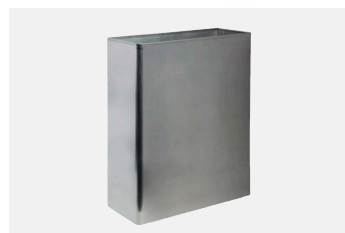
25L Waste Receptacle TSL.279