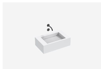
The Monolith S Series TSL.S