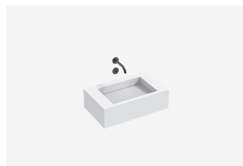
The Monolith S Series TSL.S