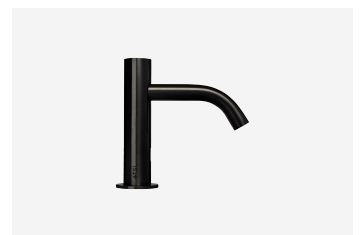
Sensor Deck Mounted Tap / Small TSL.990