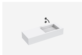
The Monolith S+ Series TSL.SX