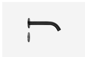
150mm IR Sensor Tap TSL.884