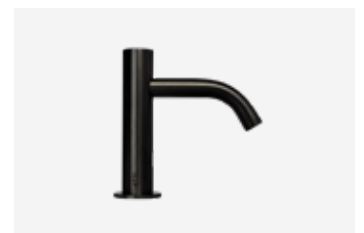
Sensor Deck Mounted Tap / Small TSL.990