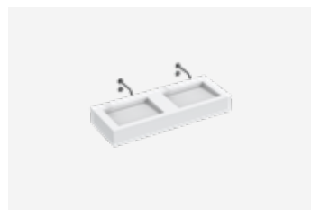
The Monolith M+ Series TSL.MX