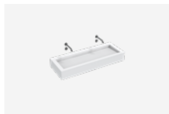
The Monolith M Series TSL.M