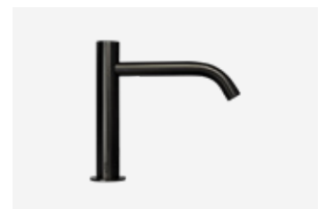
Sensor Deck Mounted Tap / Large TSL.960