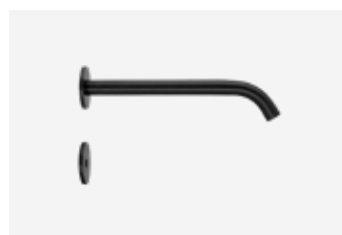
IR Sensor Tap TSL.882