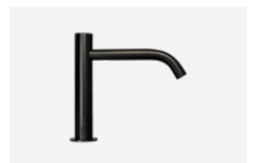
Sensor Deck Mounted Tap / Large TSL.960