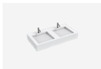
The Monolith L+ Series TSL.LX