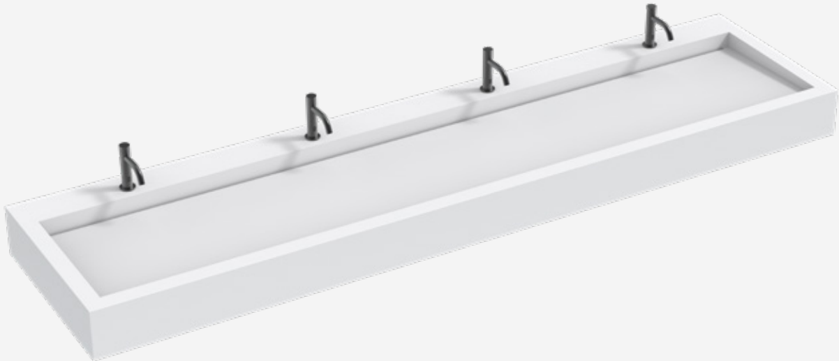
+ FOUR USER BASIN

The Monolith L Series is a modular solid surface basin system. The continuous trough and deep rear deck is ideal for both wall-mounted and deck-mounted features. This Monolith is available in a range of standard and bespoke lengths to accommodate users in any washroom.