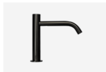
Sensor Deck Mounted Tap / Large TSL.960