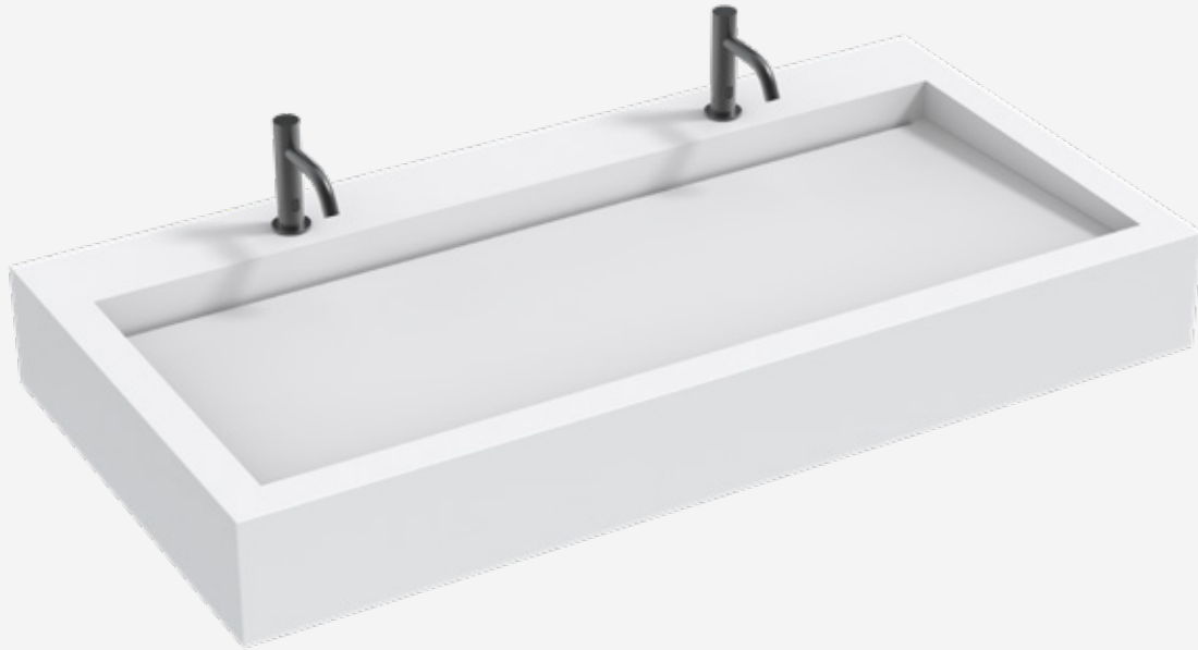
+ TWO USER BASIN

The Monolith L Series is a modular solid surface basin system. The continuous trough and deep rear deck is ideal for both wall-mounted and deck-mounted features. This Monolith is available in a range of standard and bespoke lengths to accommodate users in any washroom.