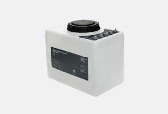
TSL - 5 Feed Reservoir TSL.MF25-5