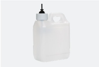
TSL - 1 Feed Reservoir TSL.270002