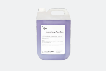
Aromatherapy Foam Soap TSL.AFS

For warranty terms and conditions please visit www.thesplashlab.com If additional spare parts are required and are not listed below, please contact us at info.uk@thesplashlab.com